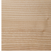
Clear Over Ash WCA