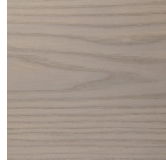
Gray Over Ash WGA